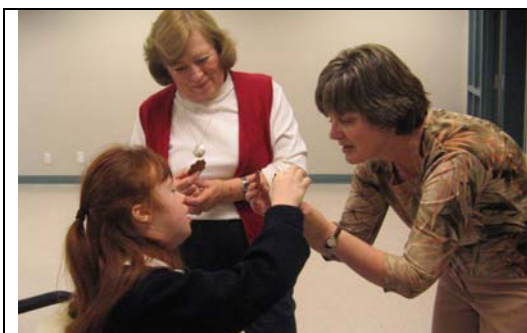
This student is making a choice about which cookie she would like.