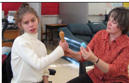
Students can choose what to use next in the recipe: e.g., the wooden spoon to mix, or the egg to go into the recipe.