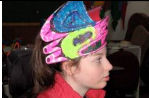
Make a colourful totem head band.