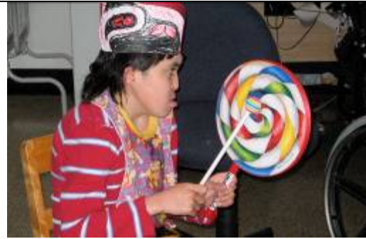
Participate in drumming with music.