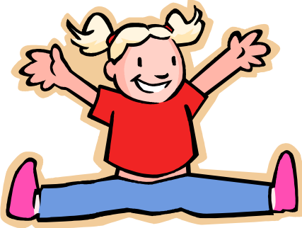
Birthdays and Celebrating with