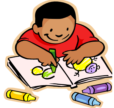
Art and Coloring